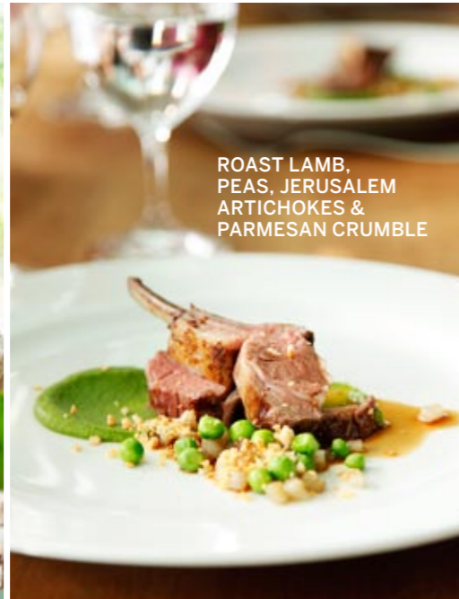
ROAST LAMB, PEAS, JERUSALEM ARTICHOKES & PARMESAN CRUMBLE