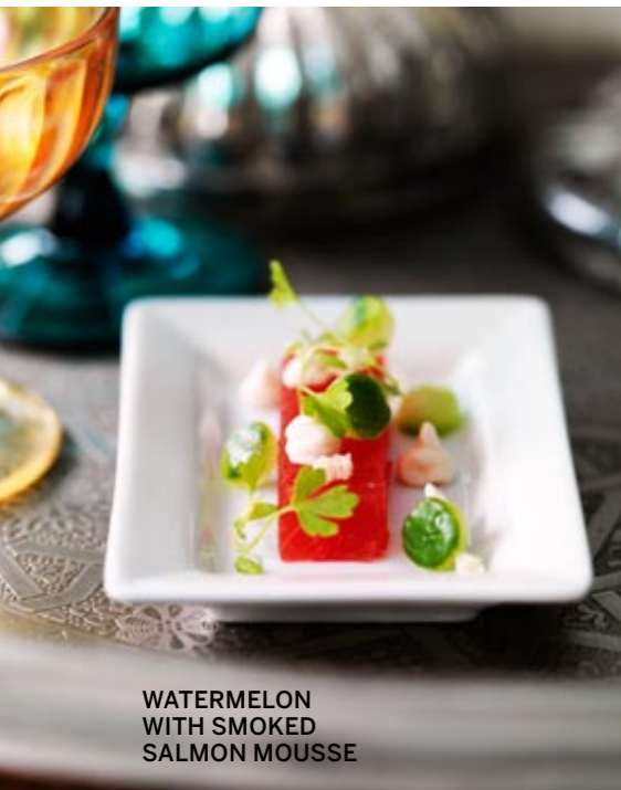
WATERMELON WITH SMOKED SALMON MOUSSE