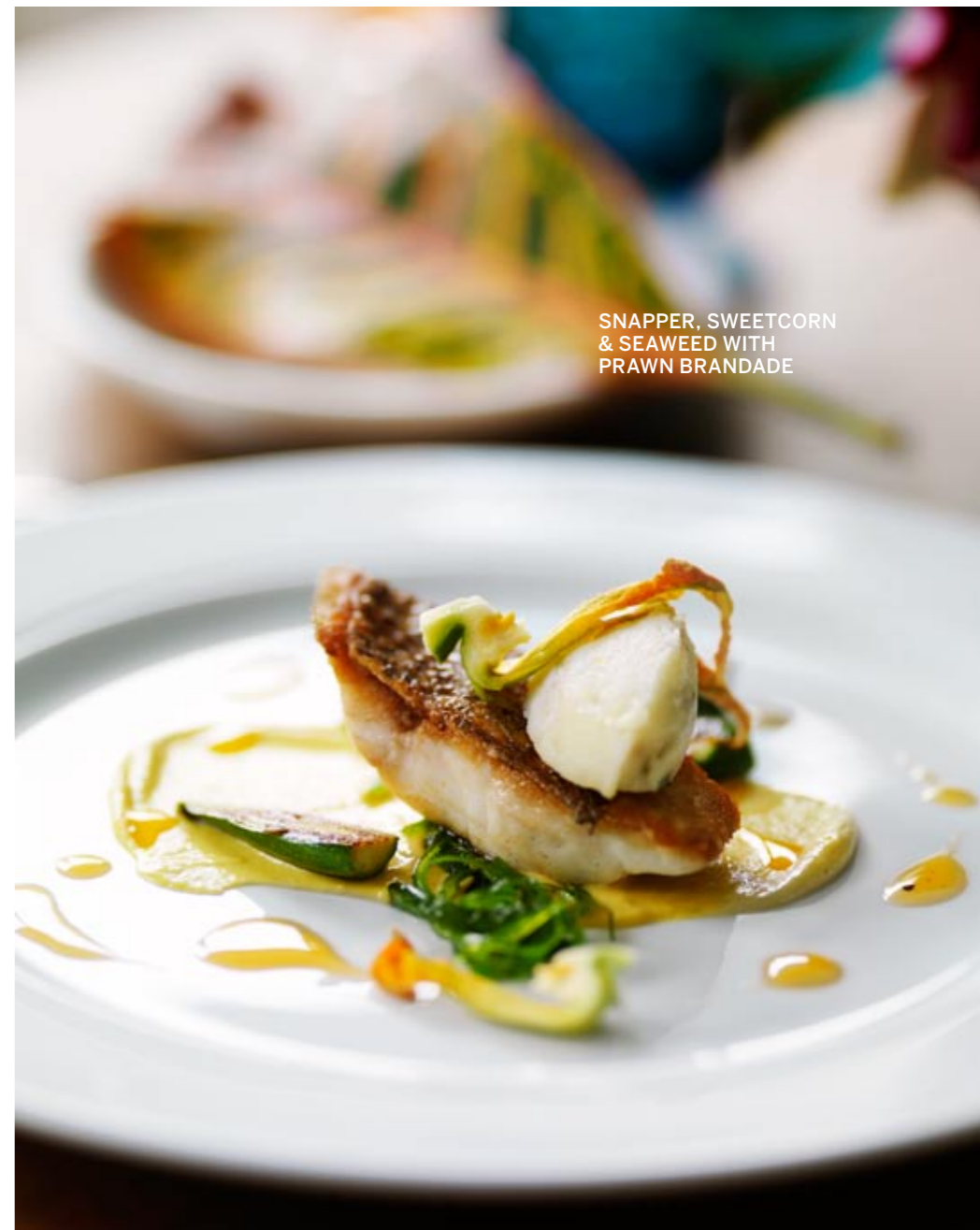
SNAPPER, SWEETCORN & SEAWEED WITH PRAWN BRANDADE